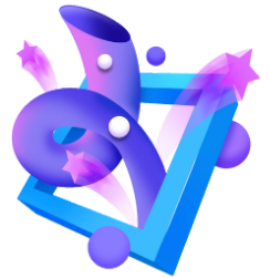
IN MOTION FINE ARTS