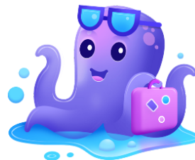
MAKING A SPLASH EARLY LEARNING