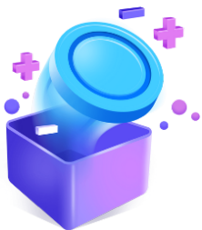
SO EXTRA IMPROVISATIONAL