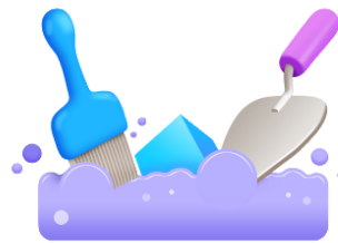
BLAST FROM THE PAST SCIENTIFIC