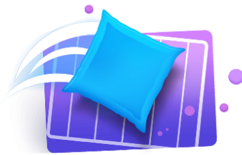
GOING THE DISTANCE ENGINEERING