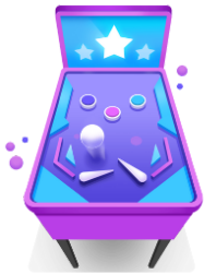
PINBALL HEROES TECHNICAL

South River High School, 201 Central Ave East, Edgewater, MD/ February 24, 2024